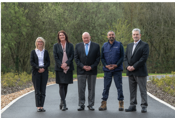
The New Forest Crematorium Team